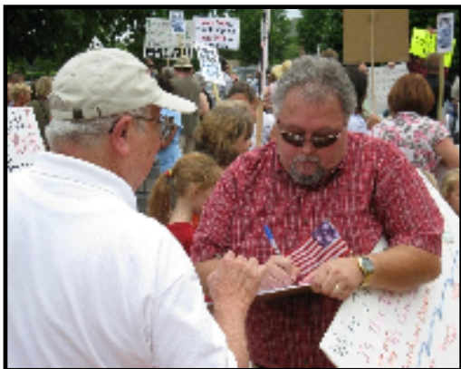
FreedomWorks activist gathers signatures on a petition declaring "We oppose socialized medicine in America"

Almost daily since July 4 petitions with hundreds of signatures have poured back into FreedomWorks headquarters in D.C., many from key states like Louisiana, Nevada, Missouri, and Florida. FreedomWorks immediately began delivering petitions to Hill offices in person, using the opportunity to again try to nail down where legislators stood on healthcare reform.