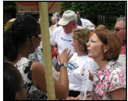
MoveOn.org and ACORN clash with FreedomWorks members in Greensboro

FreedomWorks' efforts and the September 12 event were mentioned in many papers and news outlets including Human Events , Roll Call , the Washington Examiner , the Washington Times , CBS Evening News, and even CNN, which broadcasted live from the D.C. tea party.