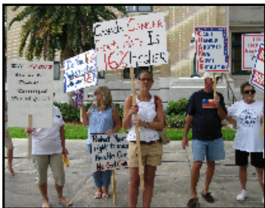
Protestors counter MoveOn.org and ACORN outside Sen. Martinez's Fort Myers office

Taking advantage of the July 4 recess, when congressmen are home in their districts, FreedomWorks prepared to go toe to toe with the leftist machine. July 24 FreedomWorks launched a second wave of attack on ObamaCare, following the success of the Memorial Day Call to Action. Members were sent to a special website where they could find all the tools they needed to organize their neighbors and make their legislators take a stand on health care reform.